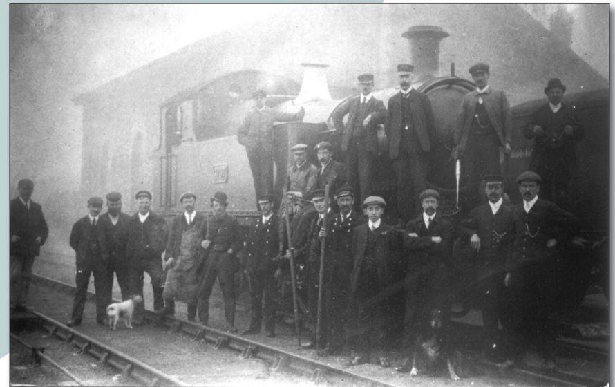
This is an interesting record of 3107 at St Blazey by the small shed which was later demolished. The engine went new to St Blazey shed on 30 April 1906 and judging by the gathering of railwaymen and dogs this photo could well have been taken shortly afterwards.