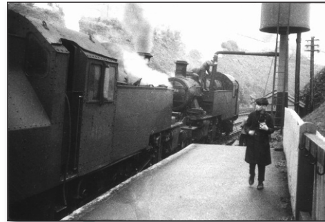
On a wet day at Calstock in the early 1960s a pair of Ivatts, 41238 and 41315, head a passenger train for Callington.