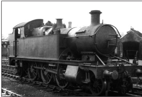
At St Blazey shed in the 1930s, 4544 is opposite the turntable.