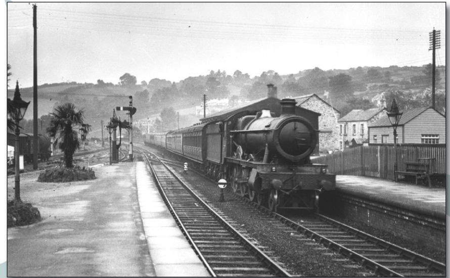
An up express enters Lostwithiel in charge of 4978 'WESTWOOD HALL', which has a very shiny safety valve bonnet, during September 1933. The goods shed is behind the engine.